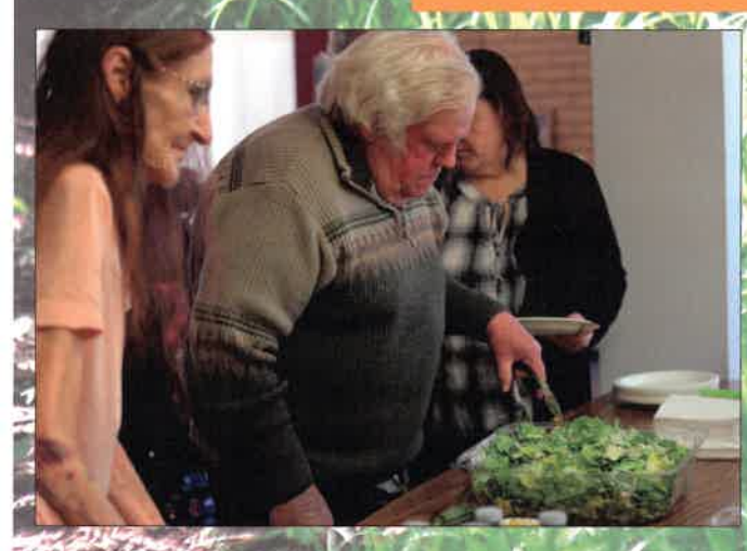
Giving back to our Volunteers. We can't do what we do without you.