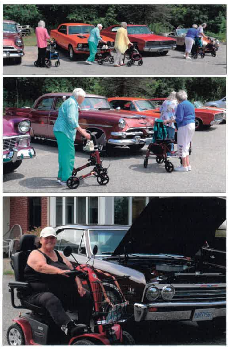
Parry Sound Cruizers treated Day Program clients and residents alike to a private, and very successful, show.